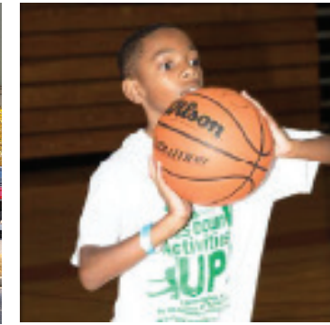
Games Down, Activities Up! Annual Health Fair