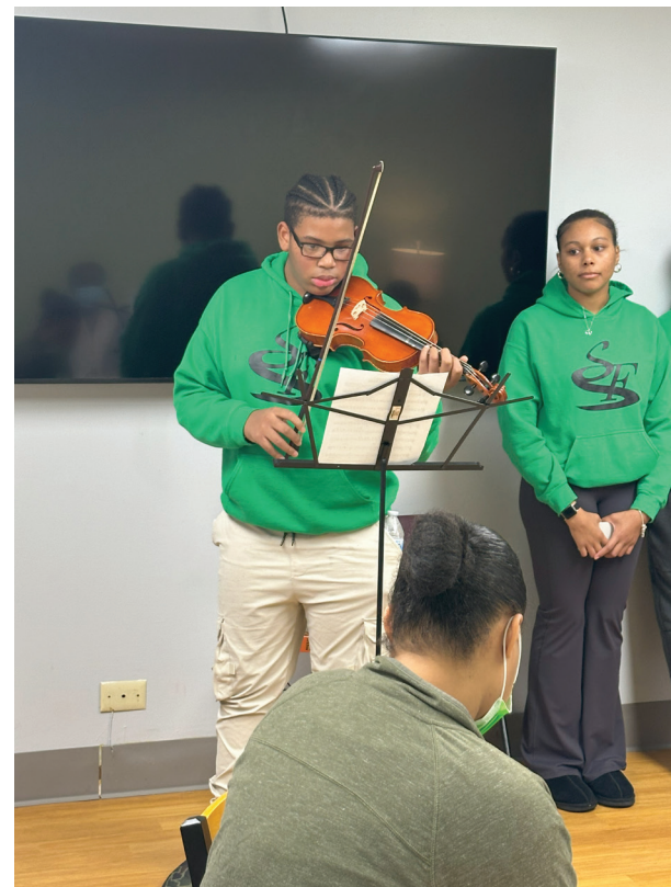
Stewart Foundation youth entertain residents at A. G. Rhodes Senior Center