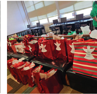
Celebrating the Holidays at The Smart Place