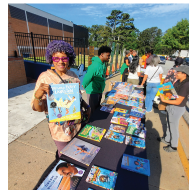
1st Row (Left to right): Games Down, Activities Up!, Thanksgiving Box Giveaway in partnership with New Life Community Church, Feeding the Hungry and Homeless. 2nd Row (Left to right): Black History Month Celebration at Historic Ebenezer Baptist Church, Celebrating our Seniors at A. G. Rhodes Atlanta, Youth Cabinet Inauguration at Atlanta City Hall. 3rd Row (Left to right): Serving breakfast to residents and families at The Smart Place, Women’s History Month Celebration at Auburn Avenue Research Library, Youth Cabinet officers engaging with visitors to Morehouse School of Medicine Health Fair. 4th Row: (Left to right): Book Distribution prior to AI Prompting workshop in partnership with Southwest DeKalb High School.

The Stewart Foundation Programs and Focus Health & Financial Wellness ■ Community Service Education Advocacy ■ Social Awareness