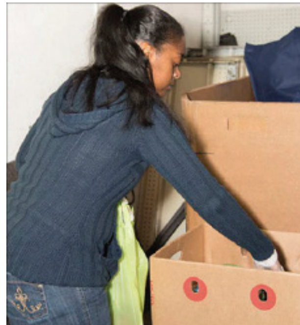
Stewart Foundation youth prepare food boxes for distribution to the local community.

*(Source: "Drawing on Diversity for Successful Marketing"-Selig Center for Economic Growth at UGA)