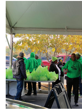
Distributing Thanksgiving boxes in the community